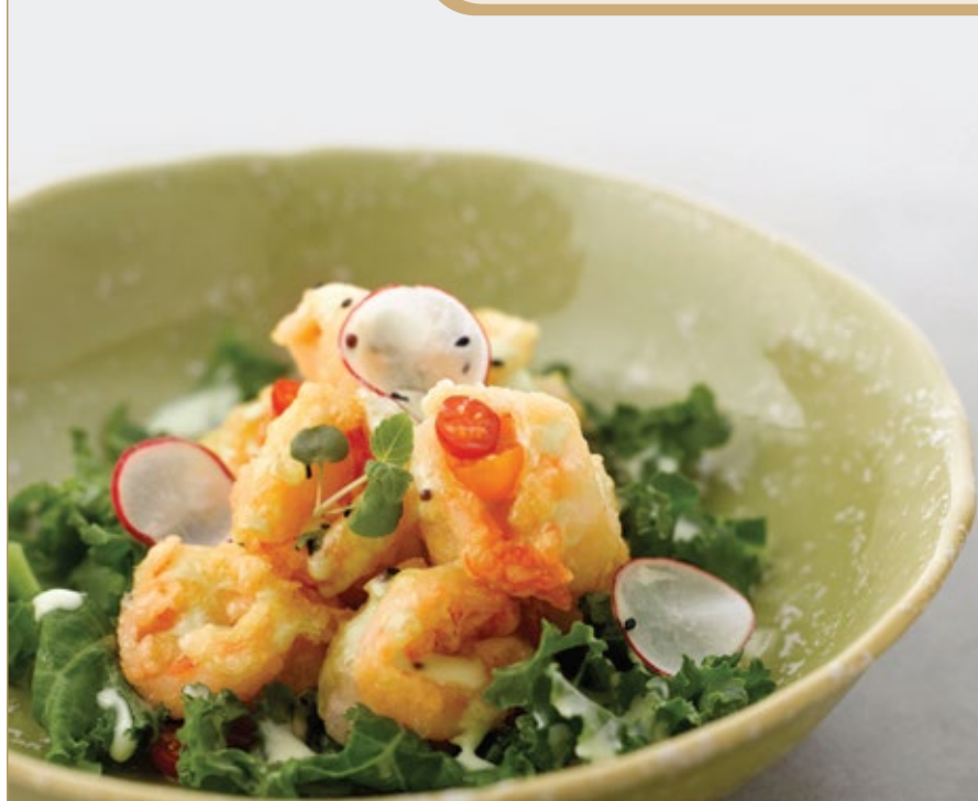
Deep-fried Prawn with Wasabi-mayo Sauce 芥末虾球