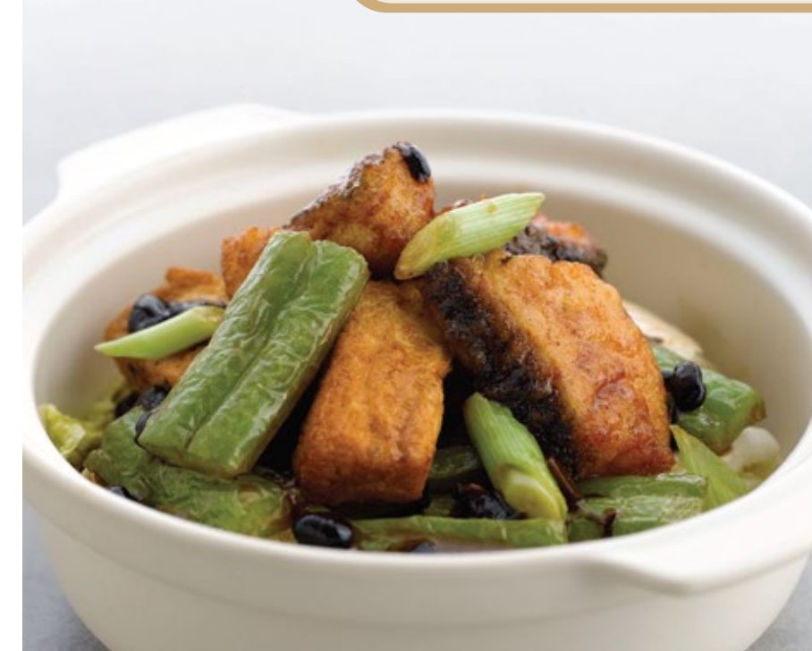
Braised Giant Garoupa Belly with Bitter Gourd and Bean Dough 凉瓜豆根焖龙趸腩