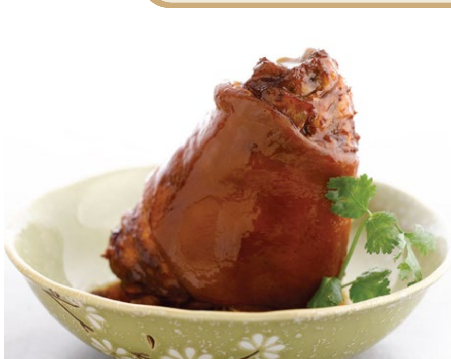
TungLok Pork Shank 同乐元蹄