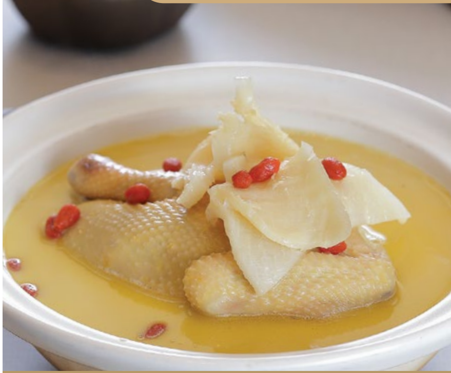
Traditional Double-boiled Fish Maw with Santori Chicken Soup 花胶土鸡煲