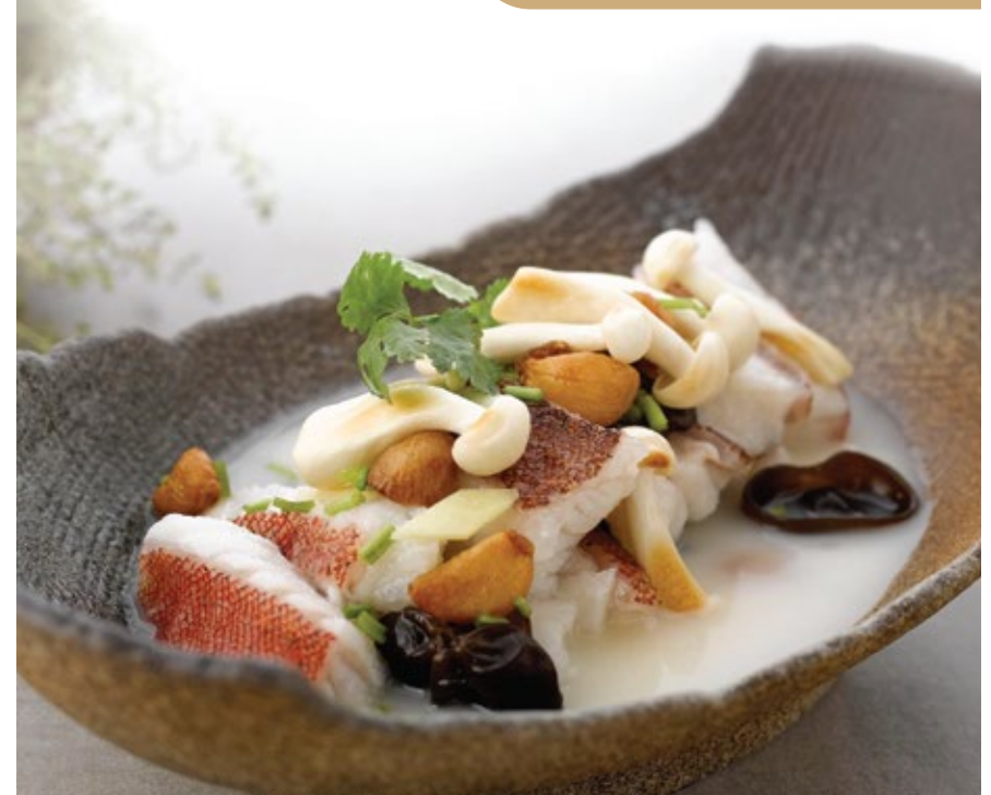
Steamed Star Garoupa Fillet with Chinese Wine and Parsley 米酒芹香蒸星斑球