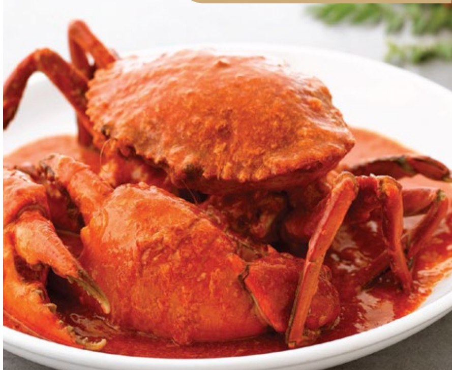
TungLok Chilli Crab 同乐辣椒螃蟹 (800g/克)